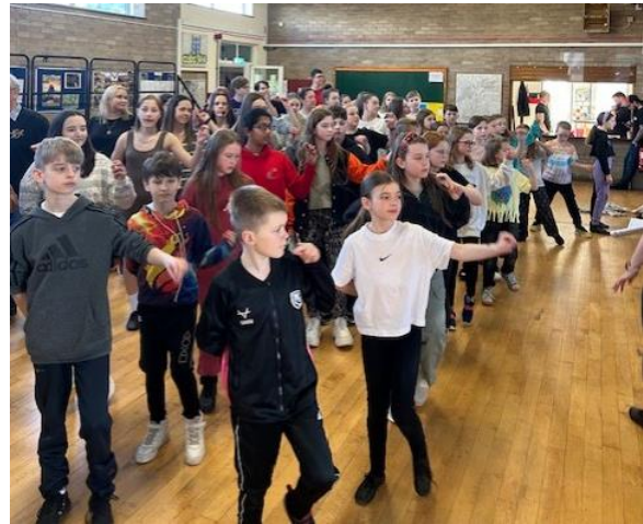
Singing and dancing at rehearsals