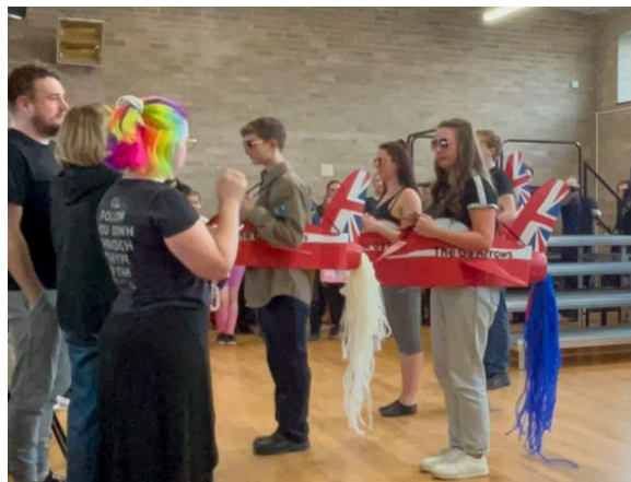
Front tab rehearsals