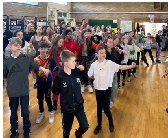
Singing and dancing at rehearsals