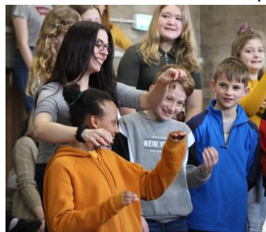
Older cast member helping a younger cast member learn a dance