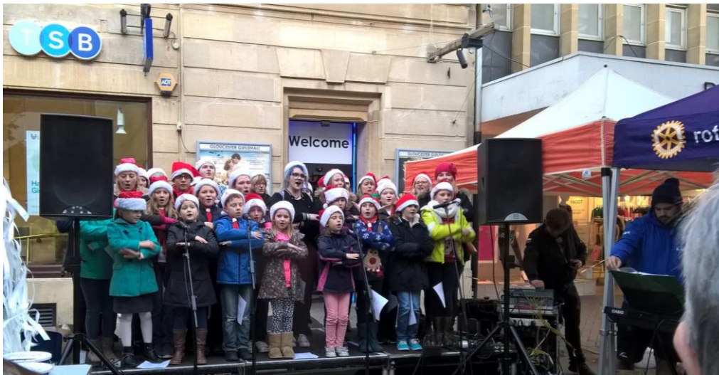
Gang members performing in Gloucester town centre

We expect every gang show member to assist in promoting the show and to sell a minimum of 6 tickets each.