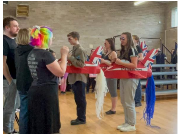
Front tab rehearsals