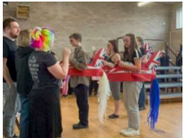
Front tab rehearsals