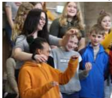
Older cast member helping a younger cast member learn a dance