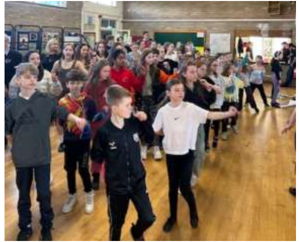
Singing and dancing at rehearsals