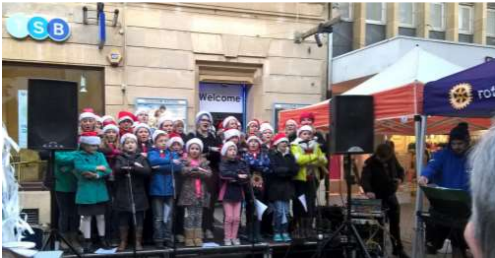
Gang members performing in Gloucester town centre

We expect every gang show member to assist in promoting the show and to sell a minimum of 6 tickets each.