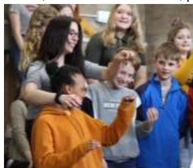
Older cast member helping a younger cast member learn a dance